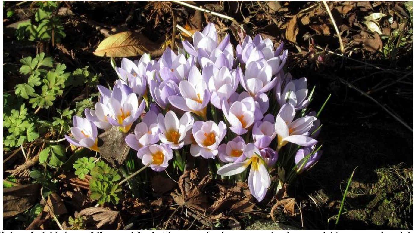
We have had this form of Crocus sieberi atticus growing in or our garden for around thirty years where it has proved to be one of the best, increasing every year and flowering freely provided we split the clumps up every three to five years.

The early flowers of spring are bringing colour to a corner of the sand bed, where you can also see some of the problems we face in our cool wet climate – the growth of mosses. Many an expert will tell you that the solution to minimise moss growth is to improve the drainage by adding grit or sharp sand – in my experience moss growth is at its greatest in the sand beds and gravel covered areas. This is not the only instance where the so-called expert advice is just being repeated and does not come from genuine practical experience.