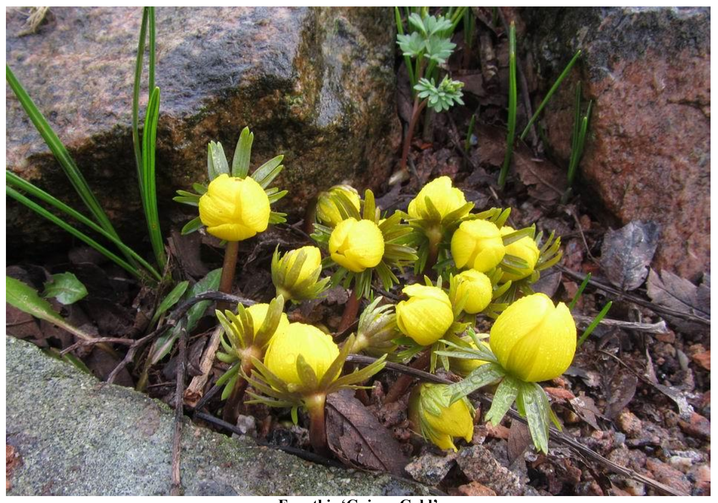
Eranthis 'Guinea Gold'