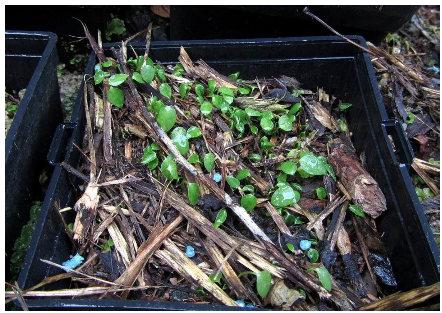
Trillium rivale seedlings germinating.

and troughs to look for more snails before they wake hungry from their winter rest.