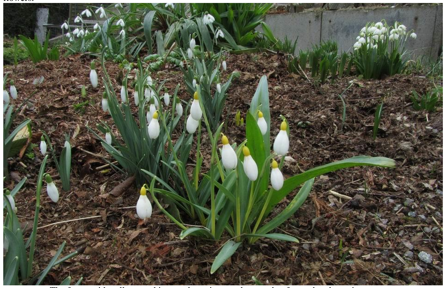
The forms with yellow markings and ovaries are also sought after and make a nice contrast.