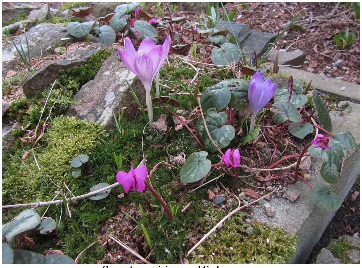
Crocus tommasinianus and Cyclamen coum

The early flowers of spring are bringing colour to a corner of the sand bed, where you can also see some of the problems we face in our cool wet climate – the growth of mosses. Many an expert will tell you that the solution to minimise moss growth is to improve the drainage by adding grit or sharp sand – in my experience moss growth is at its greatest in the sand beds and gravel covered areas. This is not the only instance where the so-called expert advice is just being repeated and does not come from genuine practical experience.