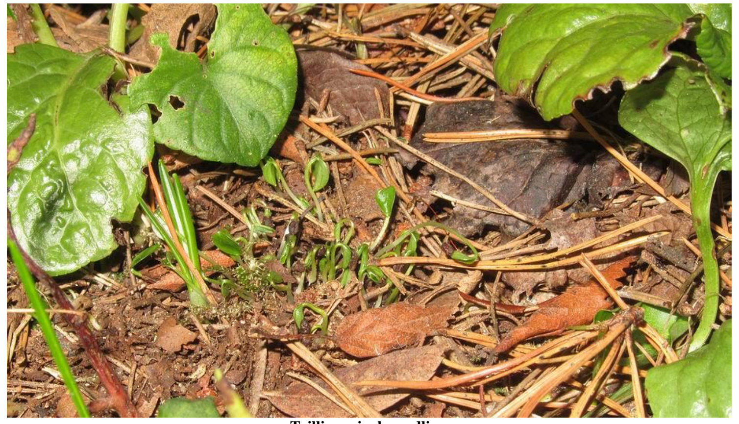
Trillium rivale seedlings

This cluster of Trillium rivale seeds are germinating exactly where the capsule fell from the plant, obviously we have nothing in our garden to help the seed get distributed around except for me and I missed scattering this one.