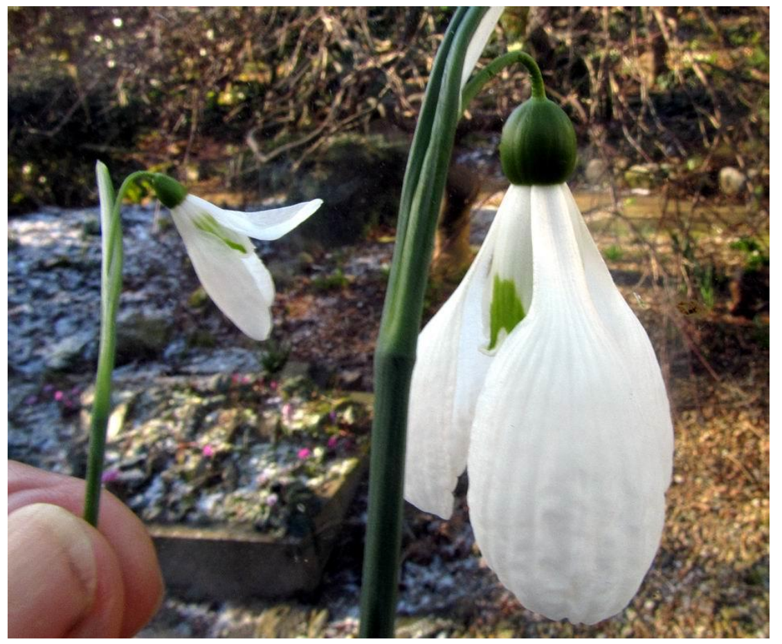
Galanthus 'Ramsay' and 'Glenorma'

Both the picture above and on the cover picture show a very striking variation of the snowdrop – I especially like the shape of the flower as well as the extensive dark green markings on both the inner and outer segments of Galanthus 'Corrin'.