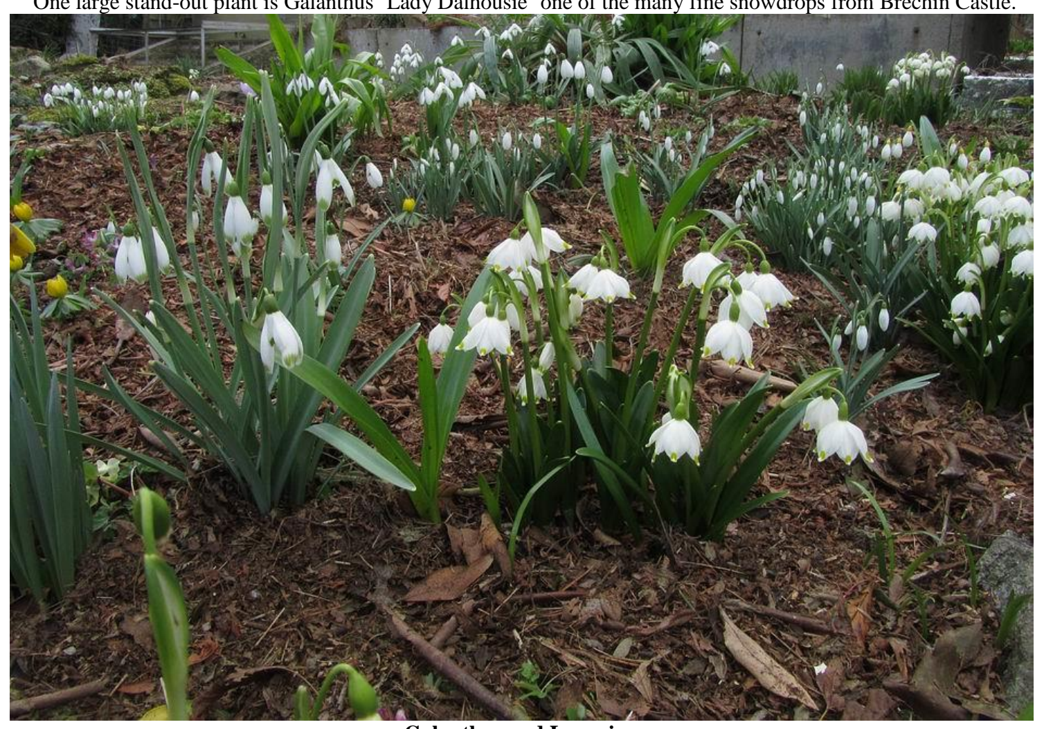
Galanthus and Leucojum

Galanthus 'Lady Dalhousie' One large stand-out plant is Galanthus 'Lady Dalhousie' one of the many fine snowdrops from Brechin Castle.