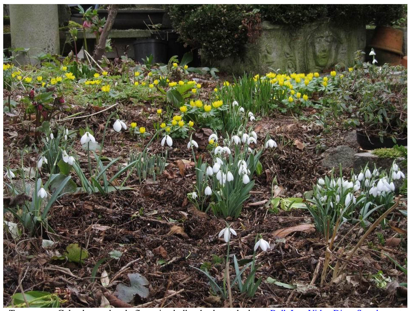
To see more Galanthus and early flowering bulbs check out the latest Bulb Log Video Diary Supplement

the Galanthophiles but this is still in its infancy and has a long way to go to catch up with the range of snowdrops.