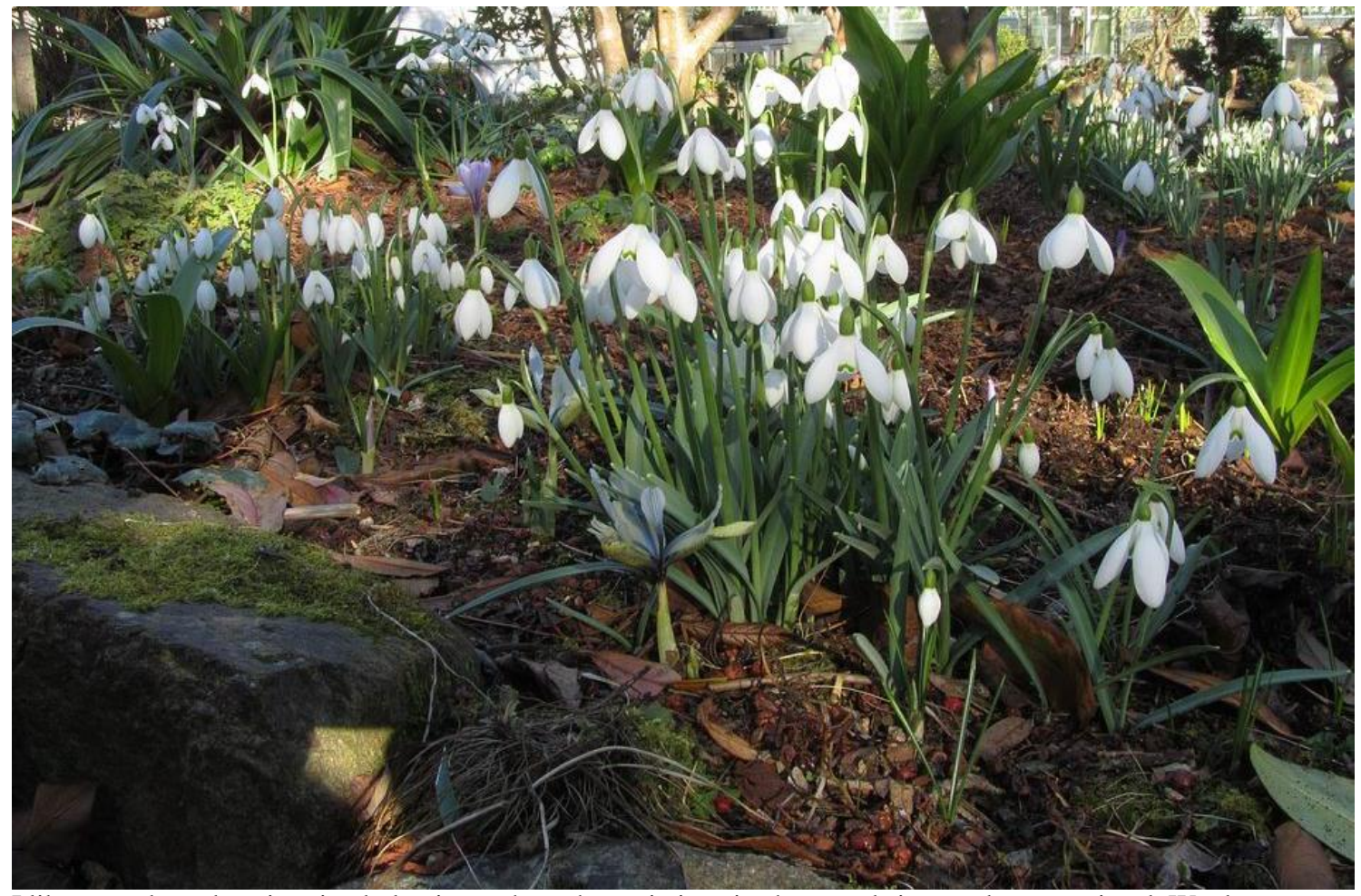
I like snowdrops best in mixed plantings where the variations in shape and size can be appreciated. We do not use labels in the garden beds so only the cultivars that have distinct and clear identities stand out.

I am happy now I have the beds tidied and covered in a fresh mulch from the compost heap before the spring bulbs come into flower.