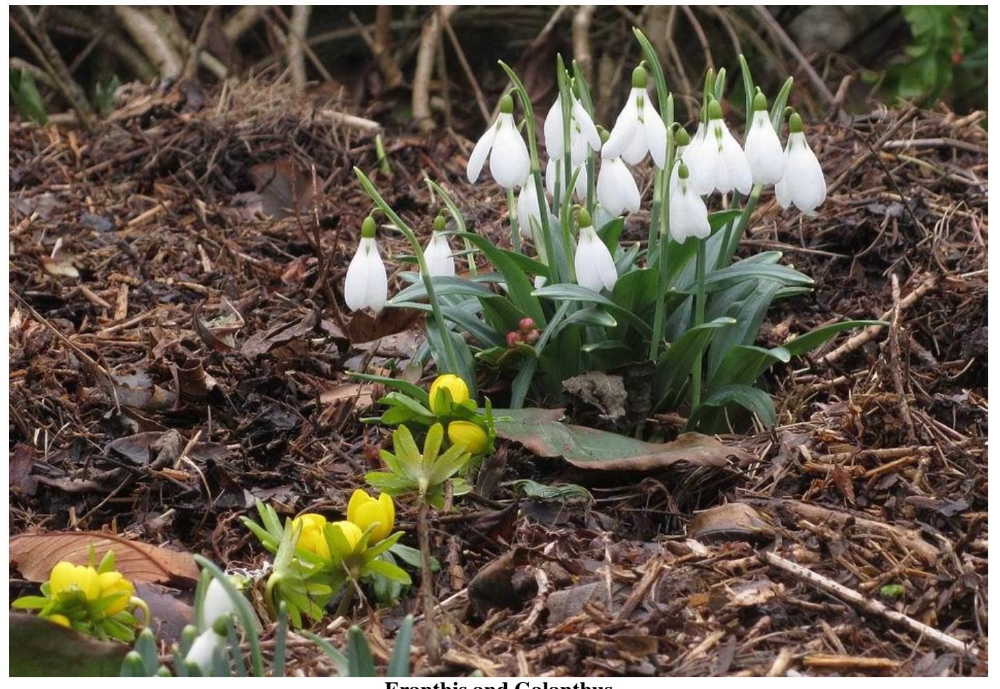
Eranthis and Galanthus

I am happy now I have the beds tidied and covered in a fresh mulch from the compost heap before the spring bulbs come into flower.