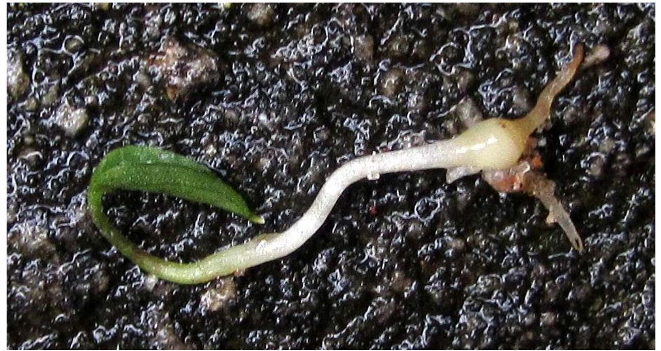
Trillium rivale seedlings

You can clearly see the swelling that will form the bulb (rhizome) of this newly germinated seedling.