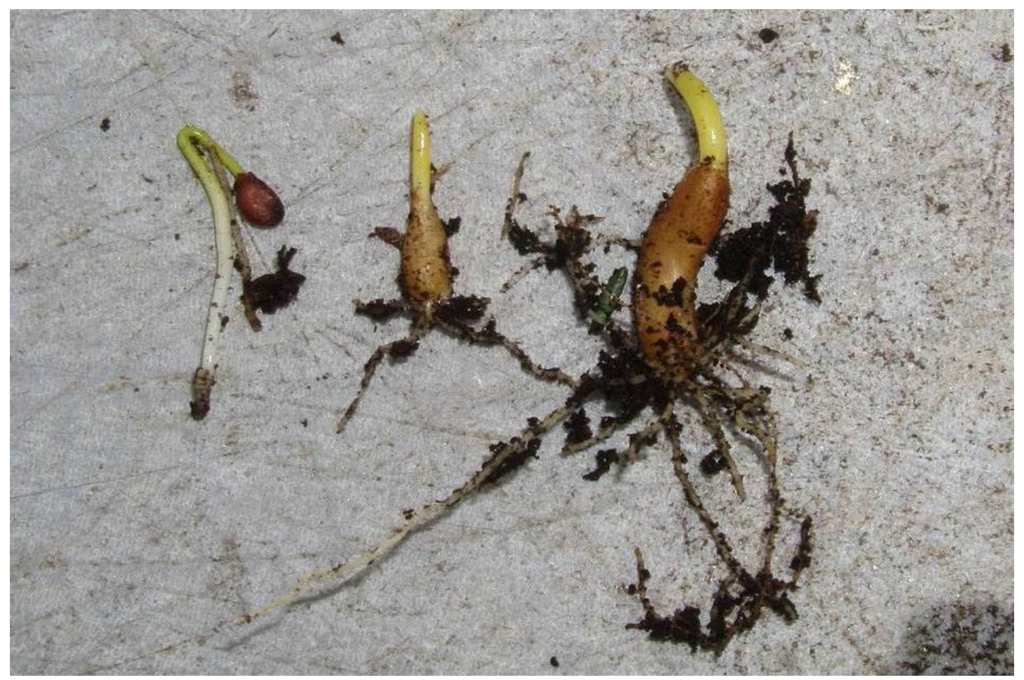
I disturbed these Erythronium seedlings as I was weeding the gravel path - one is just germinating and alongside that are one and two year old seedlings. These are self-sown seeds that were left on the plant to scatter and naturalise in the garden. This seed would have been shed around July allowing the seed to pass through the 'time window' and as a result they are germinating now while the mature Erythronium plants are also coming into growth.

This cluster of Trillium rivale seeds are germinating exactly where the capsule fell from the plant, obviously we have nothing in our garden to help the seed get distributed around except for me and I missed scattering this one.