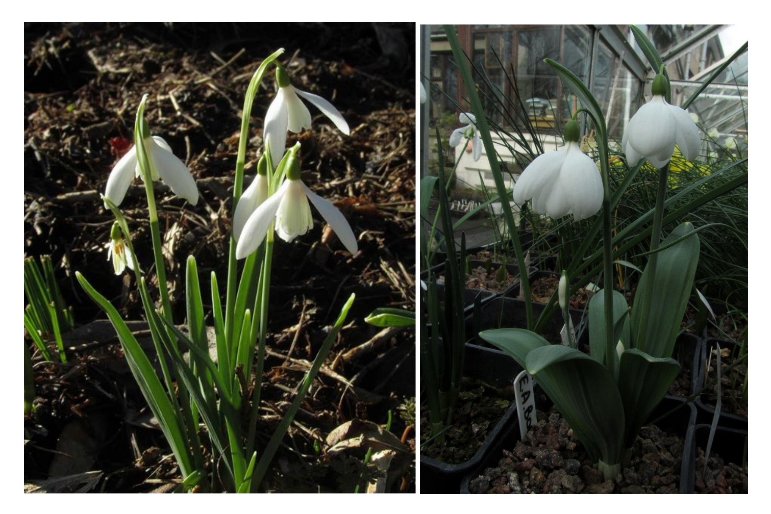
In some forms, like the unnamed group above, the inner segments are longer than the norm and in the most desirable they are equal in size to the outer ones such as in Galanthus 'E.A.Bowles' which also has pure white flowers.